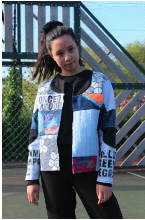
Foundation course Final design Made from cut out denims