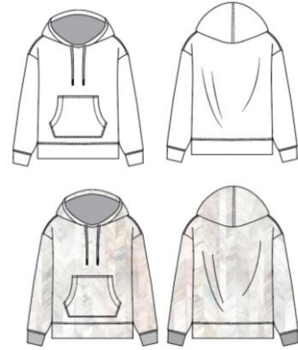
First year Adobe Illustrator Garment flats