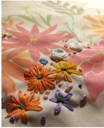
First year Heat press and embroidery experiment