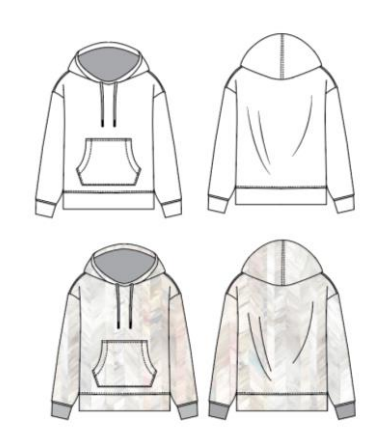
First year Adobe Illustrator Garment flats