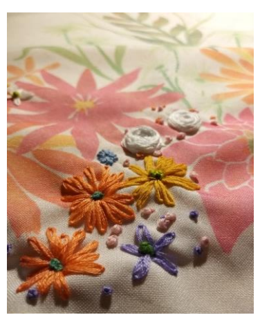
First year Heat press and embroidery experiment