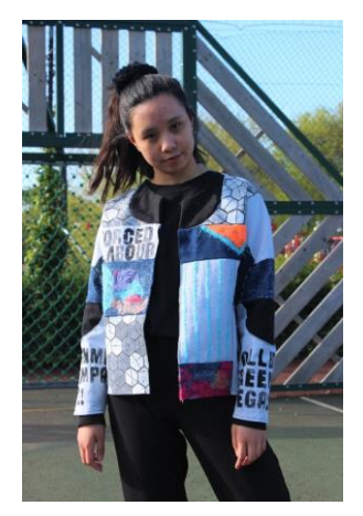
Foundation course Final design Made from cut out denims