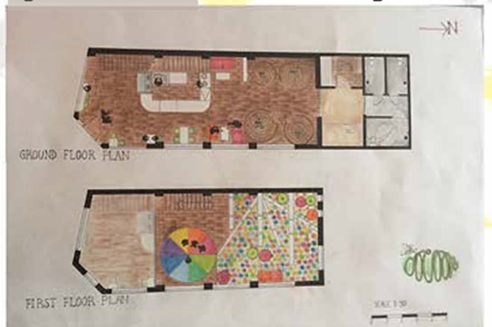
Figure 3: My proposed plan for the coffee shop.