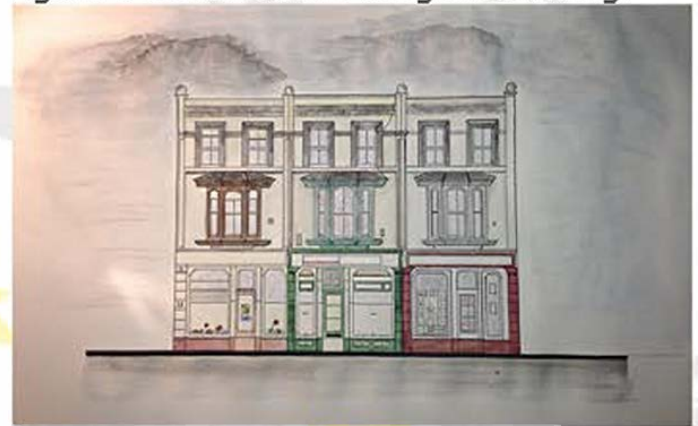
Figure 2: Rendered technical drawing.