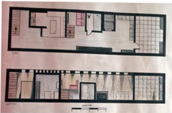
Figure 7: Atmospheric plan and section.