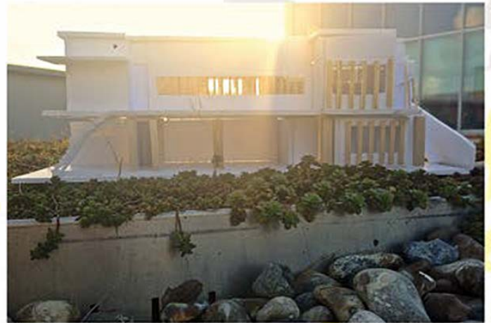
Figure 1: Scale model of assigned building.