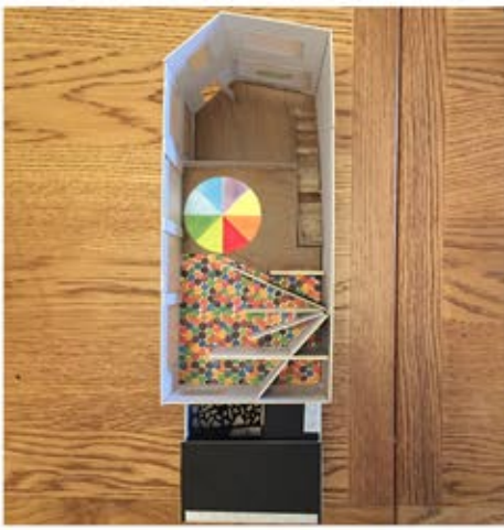
Figure 5: Scale model 1:50 for my coffee shop proposal.