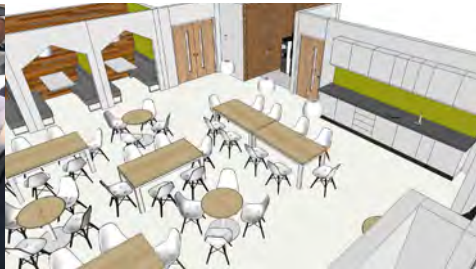
Sketchup visuals. Kenwood | Internship 2017