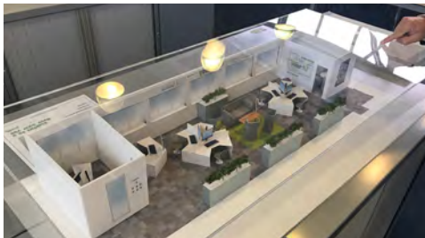
HR area model. Kenwood | Internship 2017